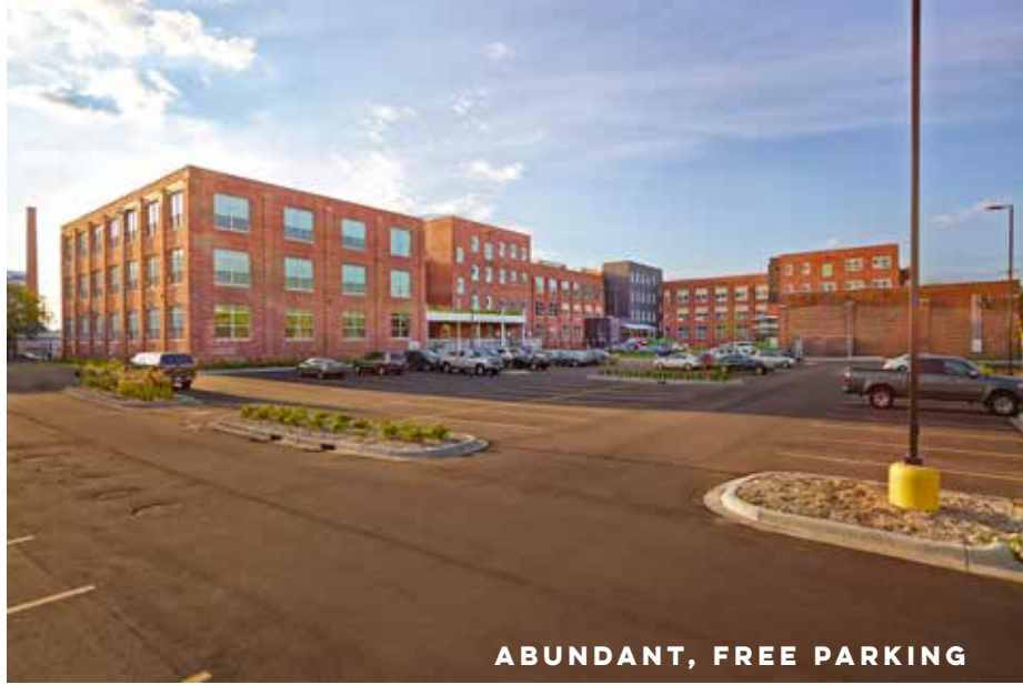
ABUNDANT, FREE PARKING

Access to metro transit bus routes & bike trail system