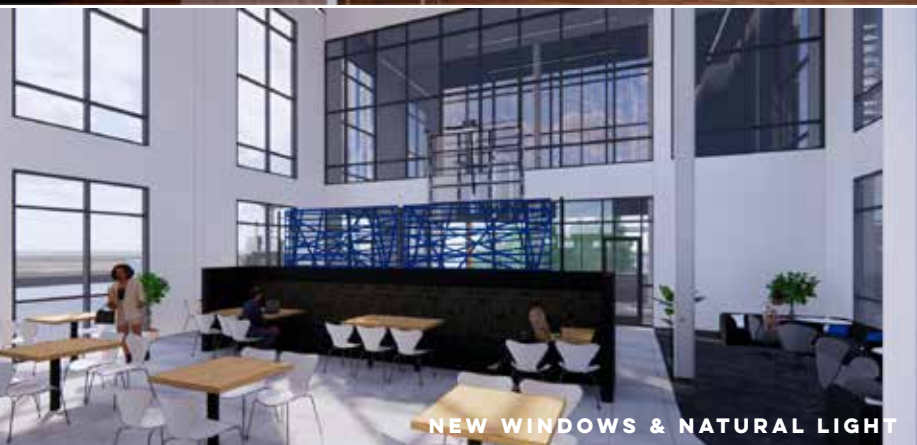
NEW WINDOWS & NATURAL LIGHT