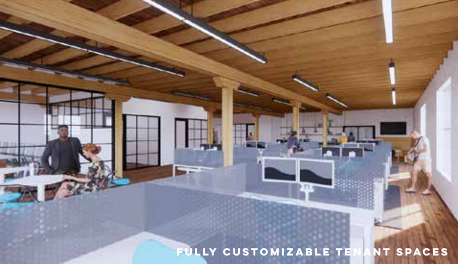
FULLY CUSTOMIZABLE TENANT SPACES