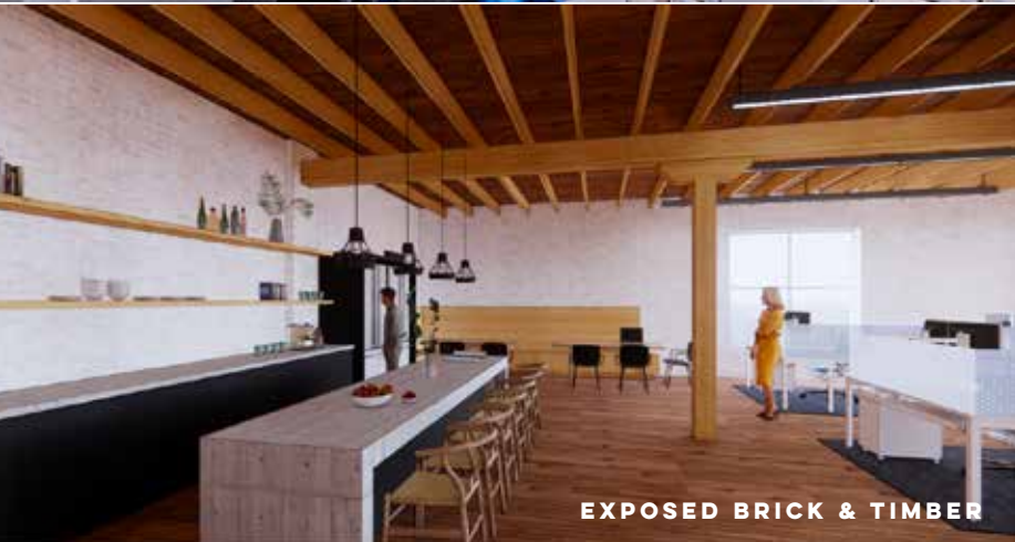
EXPOSED BRICK & TIMBER